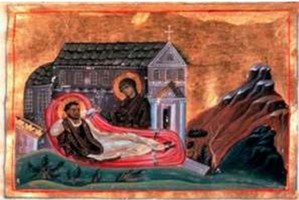
Romanos Melodos vision, in The Menologion of Basil II

It was the day before the Feast of Our Lord's Nativity, and Saint Romanos was assigned to lead the singing that evening at the All-Night Vigil. He was responsible not only for the singing but also for the text of the hymns. After everyone had left, he remained in the Blachernae Church and tearfully entreated the Mother of God to help him. Exhausted, he fell asleep with his sorrow. In answer to his prayer, the Mother of God appeared to him in a dream. She handed him a scroll and said to him gently, "Here, eat this." Roman did so and awoke, overcome with joy and the lingering presence of the heavenly visitor.