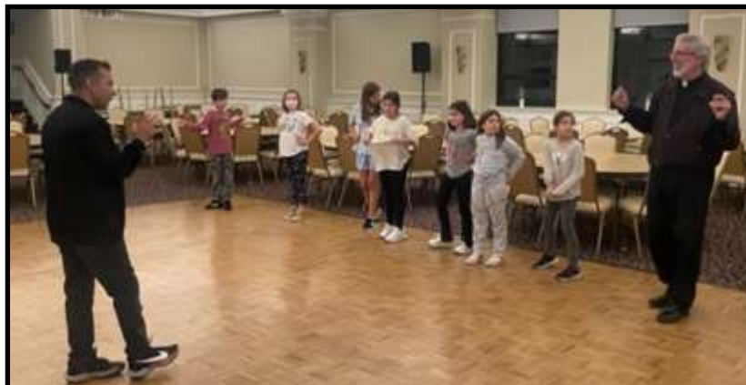
Jr. Dance practice photos at Saint Nicholas