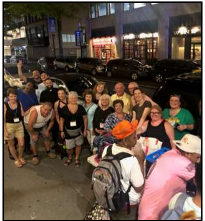
Feeding the homeless in NYC.. To all who participat5ed in this event: Thank You1