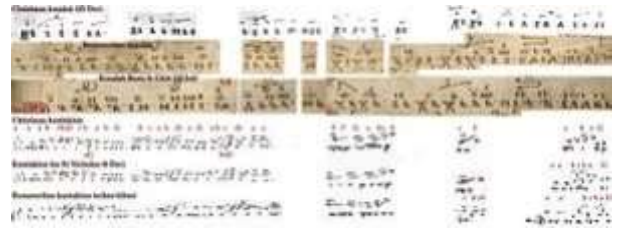
Romanos the Melodist's kontakion Ἡ παρθένος σήμερον