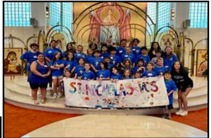
VCS Group photo