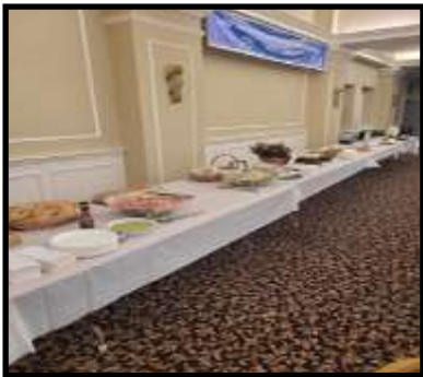
Beautiful and delicious spread prepared by Philoptochos for the celebration of the Dormition of the Theotokos Feast Day (August 15)