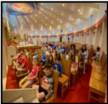
Lessons in the church

In Christ's service, The St. Nicholas Vacation Church School Organizers